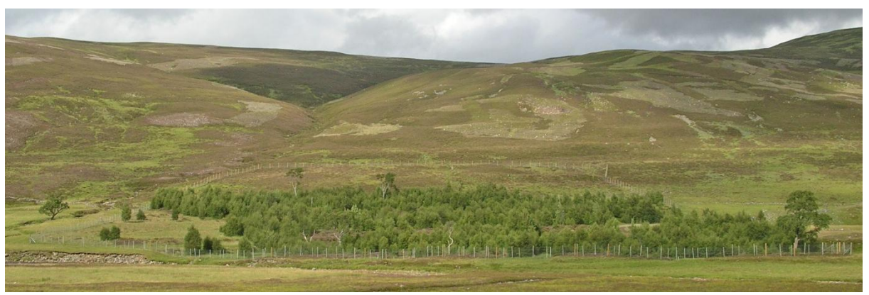
Piper's Wood, August 2013; newly-erected exclosure fence line is just visible beyond