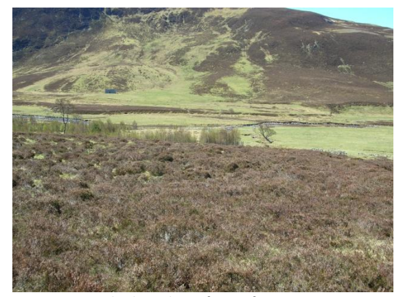
Corner B: view looking down future fence, May 2013