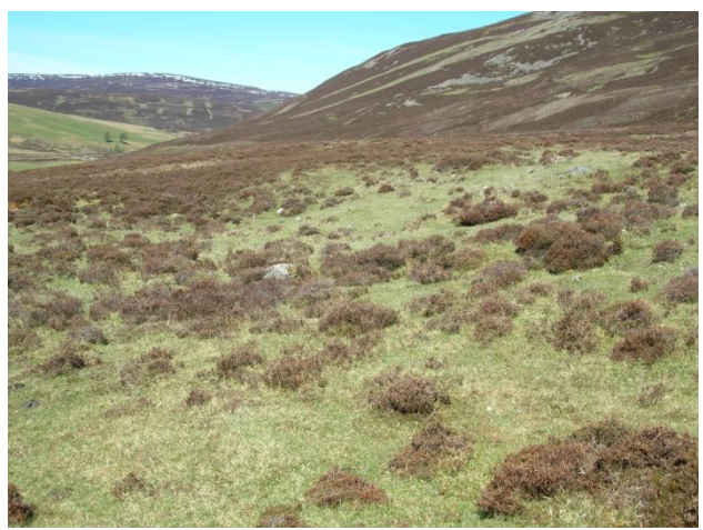
Corner C: view looking NW along future fence, May 2013