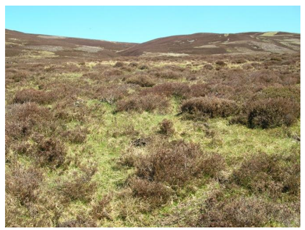
Corner A: looking up line before new fence, May 2013

Refer to Figure 1. It should be possible to re-take many from the exact same points using the GPS references on the photograph captions or as shown in Figure 1, thus illustrating future vegetation change and regeneration. All photographs in Appendices 2 and 3 have been given to the Cairngorms Club on CD for their long-term storage, along with others not shown here. Some photo pairs in May and August are not exact matches as the fence line erected in July did not always follow the lines of marker canes present in May very closely.