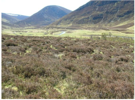
Corner B: view along 45 degree line