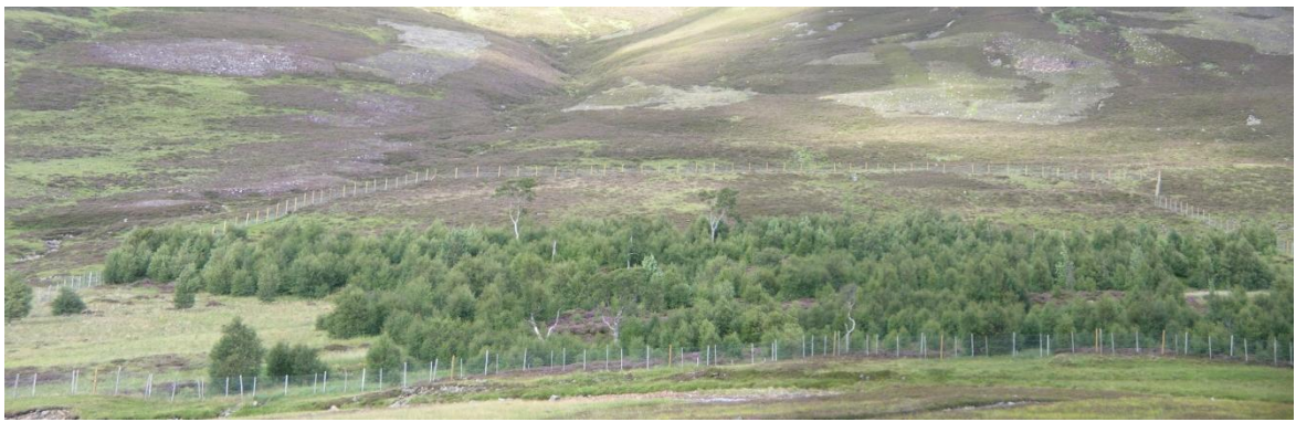
Piper's Wood from the west on 3 August 2013; newly-erected exclosure fence is visible beyond.

The extension area is largely dry tussocky grass-heath, dominated by Heather at around 60% cover, with dry and wet acid grassland covering c.35%. This is composed of Agrostis-Festuca communities with a high sedge component. Several runnels cover c.5% of the area – these are rocky and sedgerich. There are scattered rocks across the area. The area is heavily grazed by deer and only c.15 very small Birch ( Betula pubescens ) seedlings were found in the extension area, near the main runnels up hill in the east. This provides a very clear baseline against which to assess future tree colonisation! Appendix 1 lists the botanical species noted in the survey and Appendix 2 presents a series of photographs taken from fixed points.