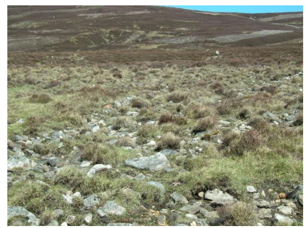
Corner D: view along 45 degree line, May 2013