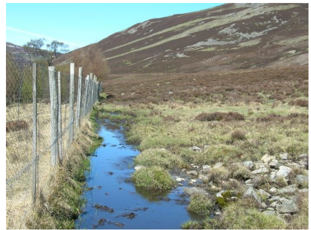
Corner D: view along existing fence, May 2013