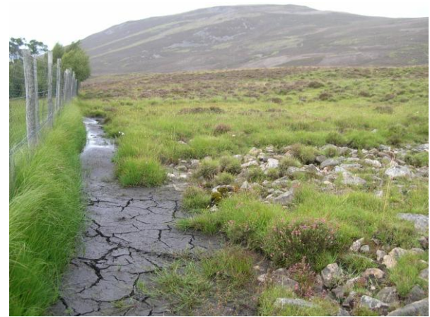
Corner D: view along existing fence, Aug 2013