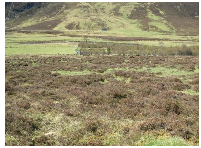
Corner C: view looking down future fence, May 2013