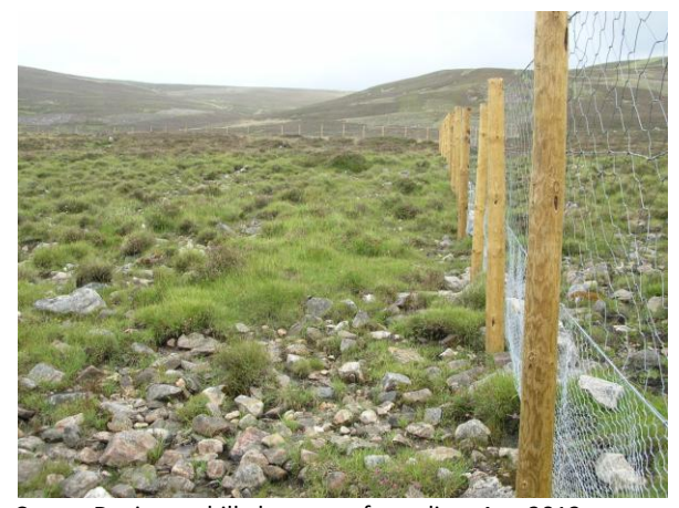
Corner D: view uphill along new fence line, Aug 2013