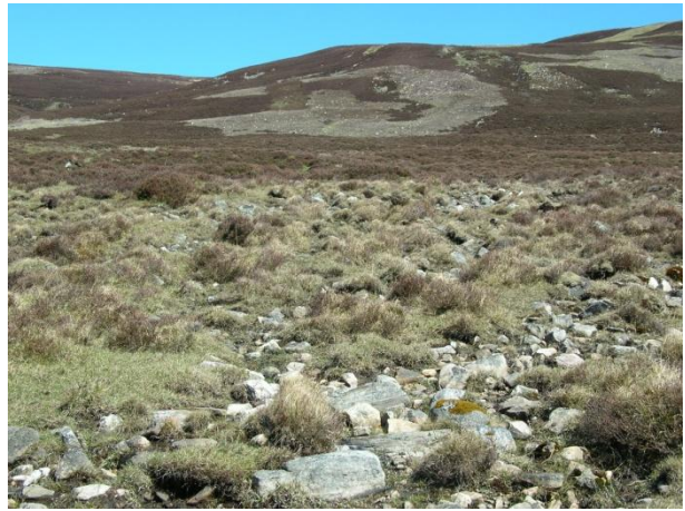
Corner D: view uphill along future fence line, May 2013