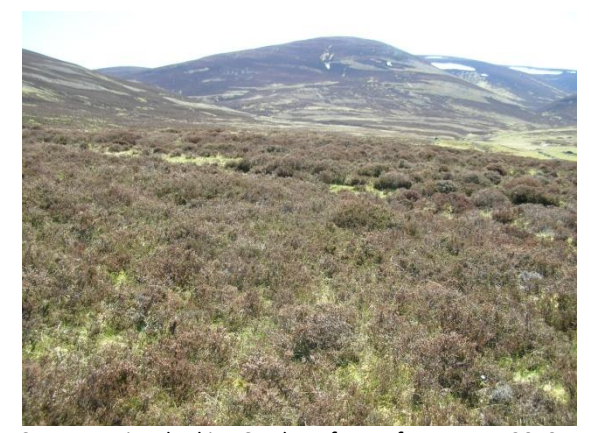
Corner B: view looking SE along future fence, May 2013