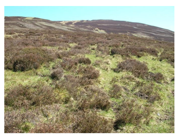
Corner A: view along 45 degree line, May 2013