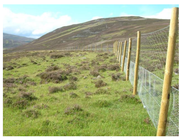
Corner C: view looking NW along new fence, Aug 2013