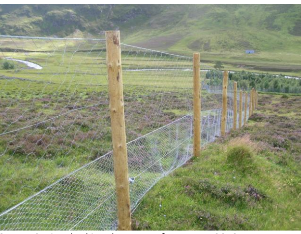
Corner C: view looking down new fence, Aug 2013