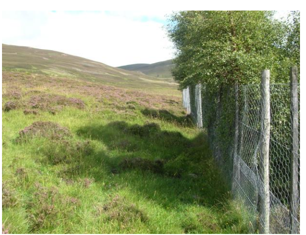
Corner A: view along old fence, Aug 2013