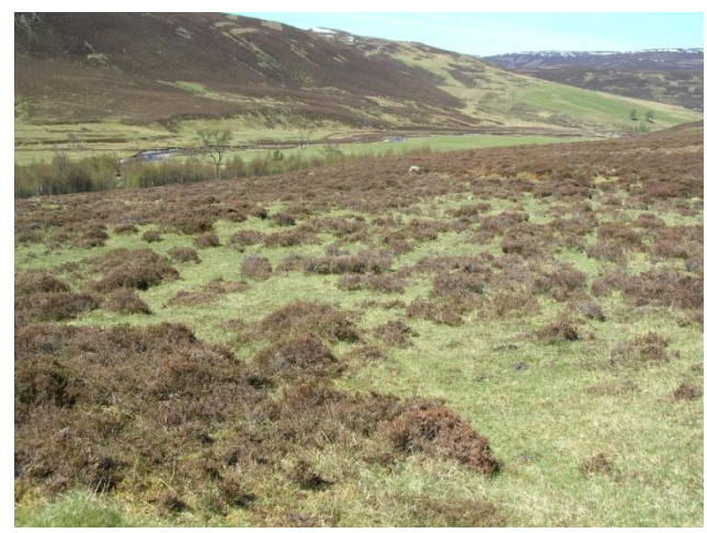
Corner C: view along 45 degree line, May 2013