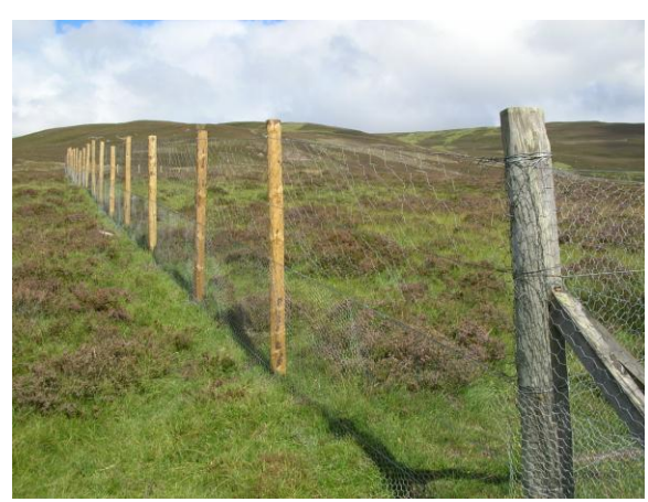
Corner A: looking up new fence line, Aug 2013