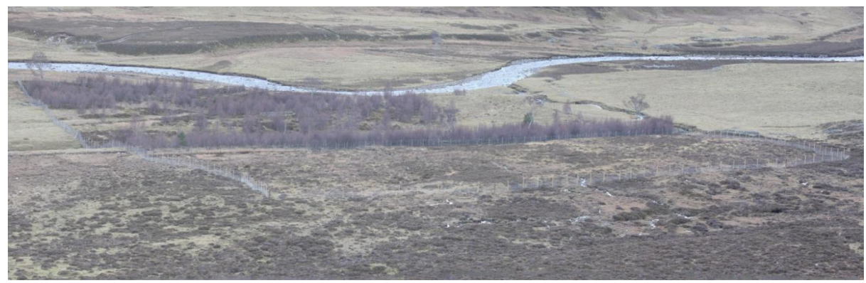
Piper's Wood with fenced extension, taken from the east, 1 December 2013