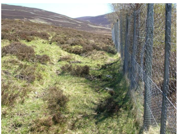
Corner A: view along old fence, May 2013