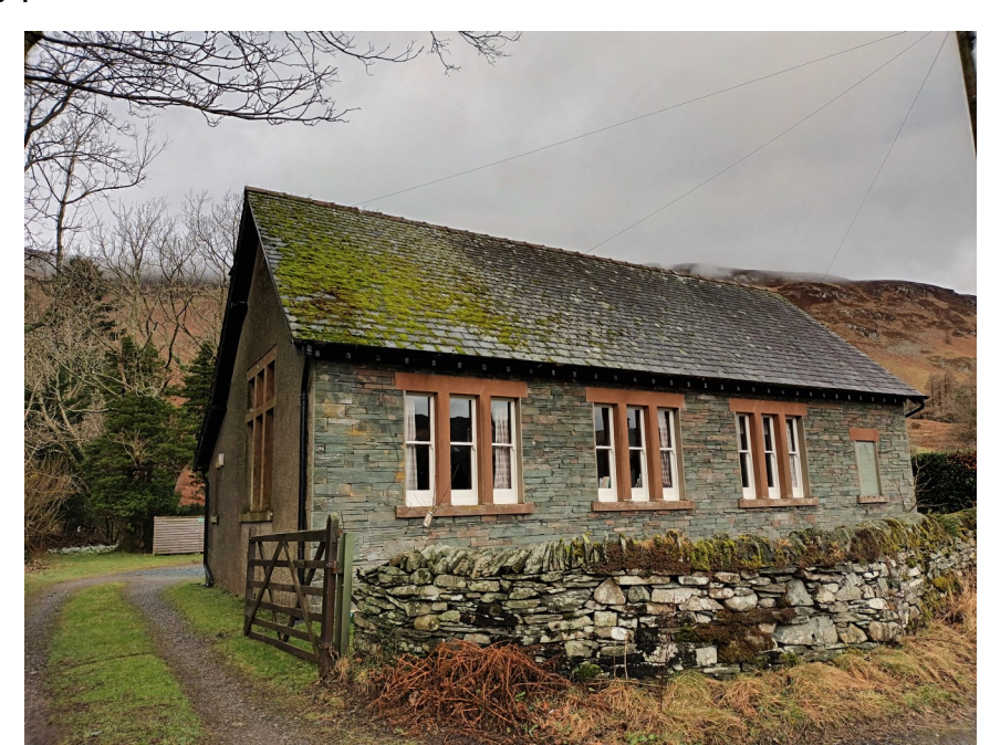
Old School, Grange

The Club has 15 cards which allow free entry to NTS (and NT, in England) properties and car parks. To borrow, please contact Ken Thomson (see back page).