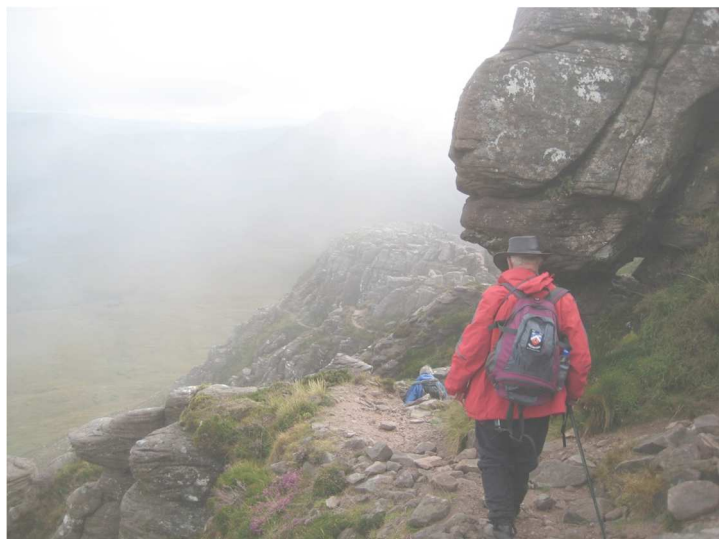
(Stac Polly Ledge)

In the evenings, they tested several local restaurants – most courses well worth the sometimes considerable wait for service! To be repeated in autumn 2018?