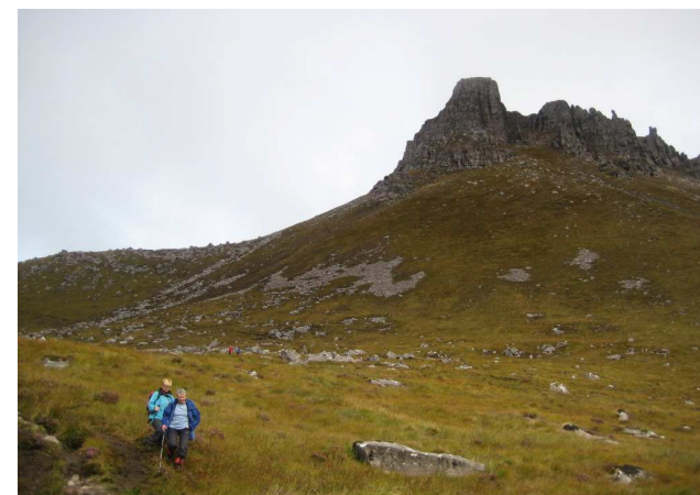
(Beneath Stac Polly)